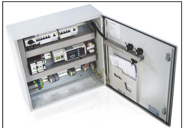
Raychem HWAT electrical panel for integrated control, monitoring and electrical connection

Tyco Thermal Controls (UK) Ltd 3 Rutherford Road Stephenson Industrial Estate Washington Tyne & Wear NE37 3HX salesuk@tycothermal.com