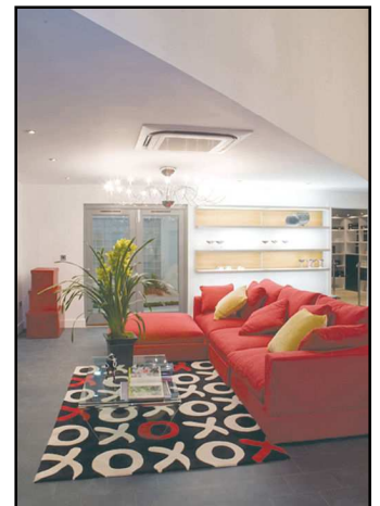
Round Flow Cassette as Installed

Space Airconditioning plc Willway Court 1 Opus Park Moorfield Road Guildford Surrey GU1 1SZ