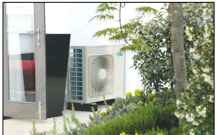
Outdoor Split Air Conditioning Unit