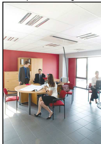
Ducted Unit as Installed