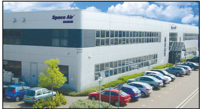
Space Air HQ Based in Surrey