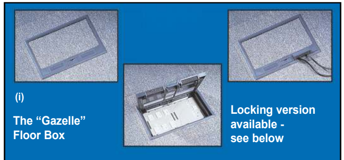
(i) The "Gazelle" Floor Box