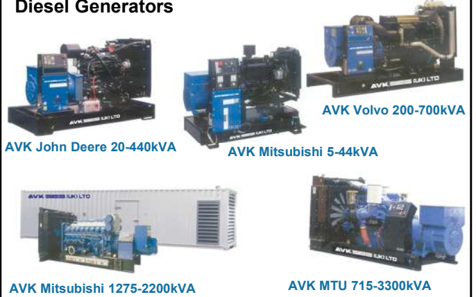
AVK John Deere 20-440kVA